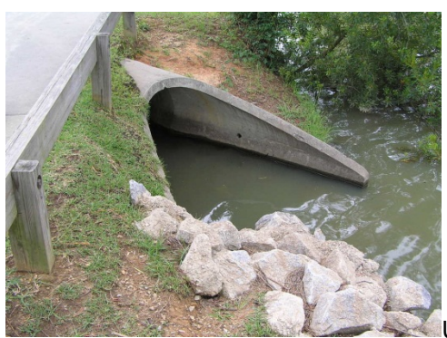
Use Pipe Flared End Section when specified in the plans or special provisions.